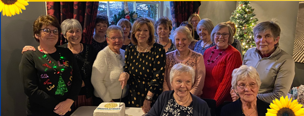
Left: Keswick Shop Volunteers Below: Wigton Shop Volunteers Bottom: Carlisle Shop Volunteers

To find out more about volunteering in our Shops, please contact your local store. Thank you to everyone who supports our Shops!